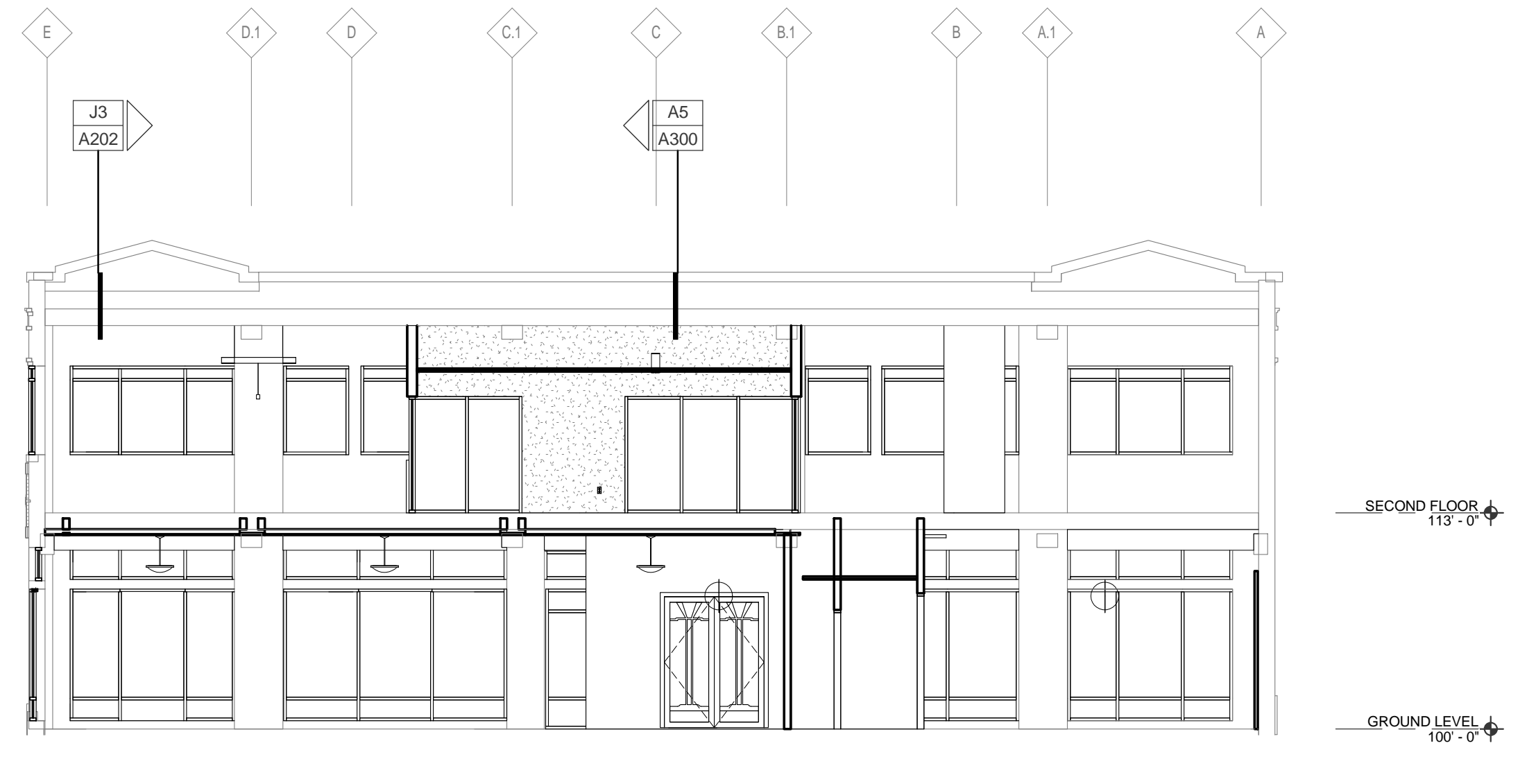
E7 BUILDING SECTION SCALE: 1/8" = 1'-0"